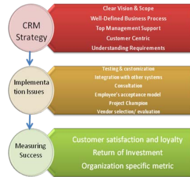
Fig. 3 CRM best practice implementation model

This proposed implementation model can be seen as a best practice model (see Figure 3). It is composed of three basic elements. These are CRM Strategy, Implementation Issues and Measuring success. The first element, CRM Strategy, has a number of factors that are required for the success of this element. First of all is the top management support that should be won and should be part of the whole implementation from the first step until the whole project is finished. Second, there is the clear CRM vision and scope where a good understanding of what is wanted from CRM