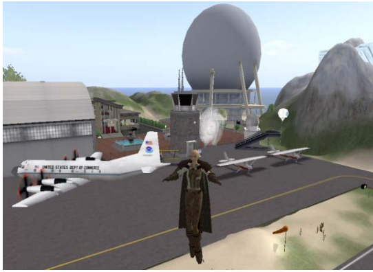
Fig.1 An avatar visiting NOAA in Second Life