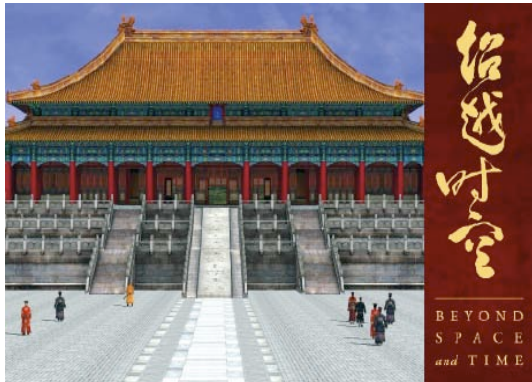
Fig. 3 A group of avatars visiting the Virtual Forbidden City

The Forbidden City: Beyond Space and Time is a joint venture between China's the palace Museum and IBM. This IBM Corporate Citizenship project provides the means for global audience to explore Chinese culture and history. It is the world's first online virtual world dedicated to a country's cultural heritage.