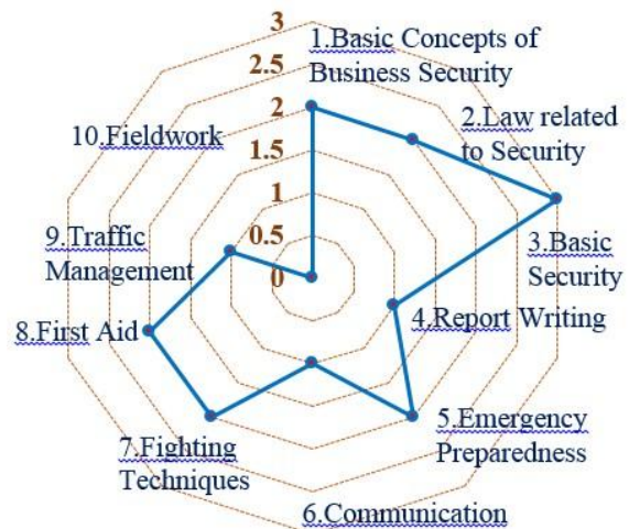
Fig. 1 Weighted Hour of Course Title of Theory 16 Hours for Security Training Curriculum