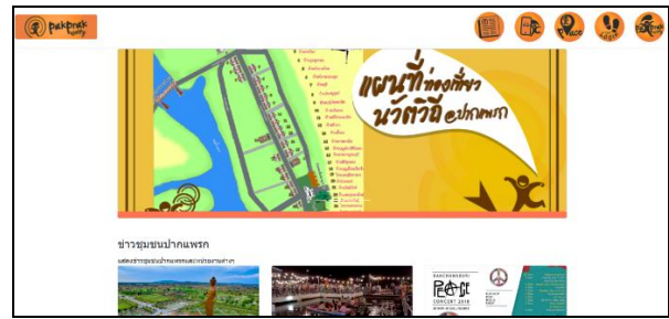
Fig. 2 Website Display on http://www.pakpraktivty.com

Install the website for users and webmaster store the website information at http://www.pakpraktivty.com as fig. 2.